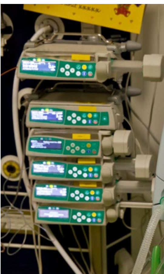
▲ Infusion pumps provide fluids, medicine or nutrients into the blood